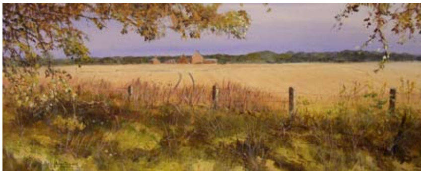
CLOCKWISE FROM ABOVE After the Harvest in Kirkby Moor; Linwood Warren; Charcoal Burners at Moor Farm; Country Gate in Hatton Meadows; Dark Pool at Linwood Warren.

I started painting early in the new year, eventually completing 22 paintings, constantly aware that each had to have a sense of place. I worked in mixed media – watercolour, ink, acrylic, pastel and charcoal. One painting of a wild day on the coast was completed in inks over a wash of tea, this being my 10-year-old granddaughter's suggestion. We're never too old to